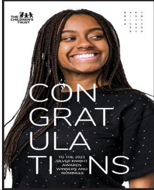
May 20 Facebook

Congratulations to all the Silver Knight Award nominees and winners! The future is bright in the hands of this next generation.